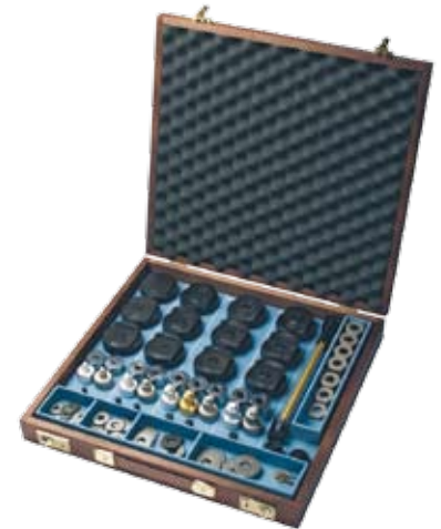
Standard adapter kit