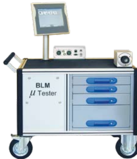
BLM \mu Tester

available: one flat, one to be used with washers and one designed for customer made plates. Adapter kits 25 and 200 are supplied in a wooden case. For the BLM \mu Tester, the adapters are stored in the drawers. The kit for TPT 2000 is supplied in a heavy duty trolley due to the weight and size of the parts.