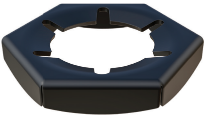
For metric thread Series 1 (6 locking teeth)